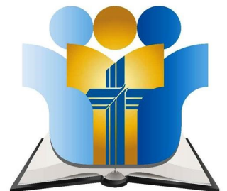
Saint Michael Lutheran CHURCH • DAY SCHOOL • FOUNDATION

Sat: 5:30 pm Informal Sun: 8:00 am Traditional 10:45 am Blended